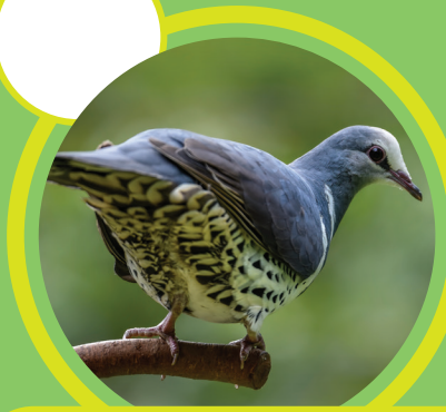
Wonga pigeon (Leucosarcia melanoleuca)

KANGAROO Walkabout & KOALA Rooftop SPOTTED,